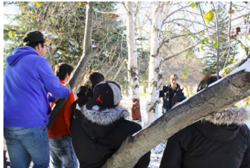
Elder led Outdoor Experience (PVO & Kinuso Outreach Schools)