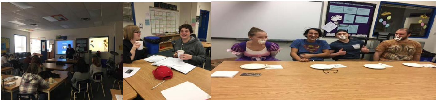
Examples of student wellness and fun activities at Lakeside Outreach School