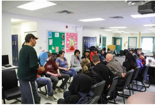
Hand Games at Prairie View Outreach