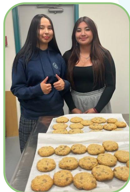
Oatmeal Chocolate Chip Cookies

Gift Lake water is the nectar of the Gods!!!