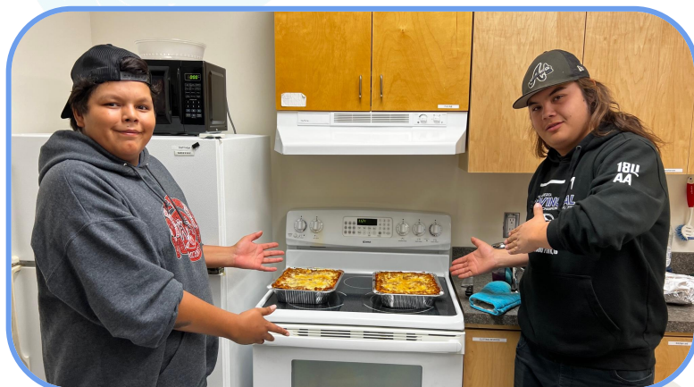
Lovely lasagnas made by students in foods... they were delicious!

We would love to see you in person, but if you are unable to attend, we would also be happy to talk to you over the phone. Call us at (780) 523–4200.