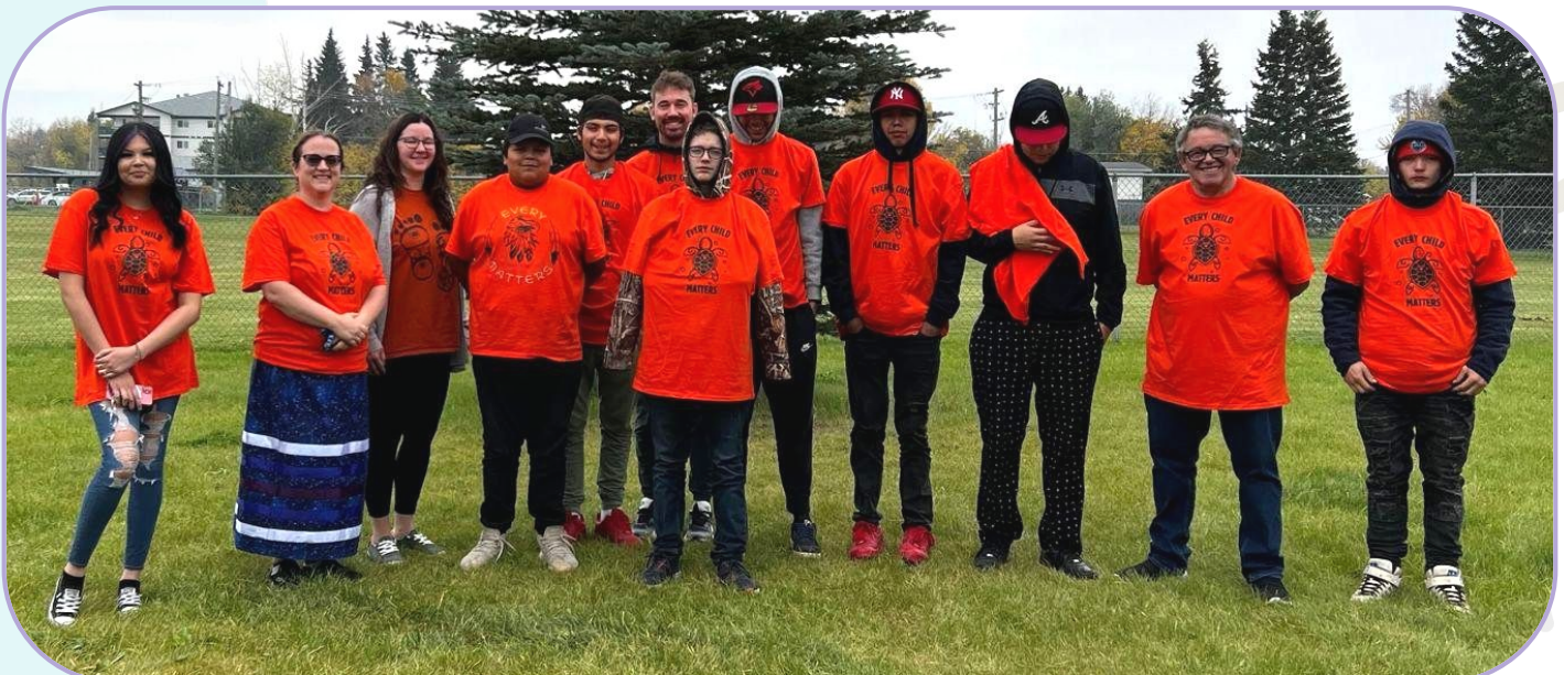
Orange Shirt Day 2023

On October 6, the School Division sent all parents / guardians an email with their information to access the parent portal with student attendance and grade information. If you did not receive one, please let us know so we can correct your email information and get you set up.